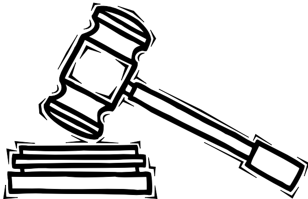
Internal Affairs Commission