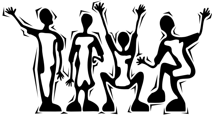
Campus Activities Commission