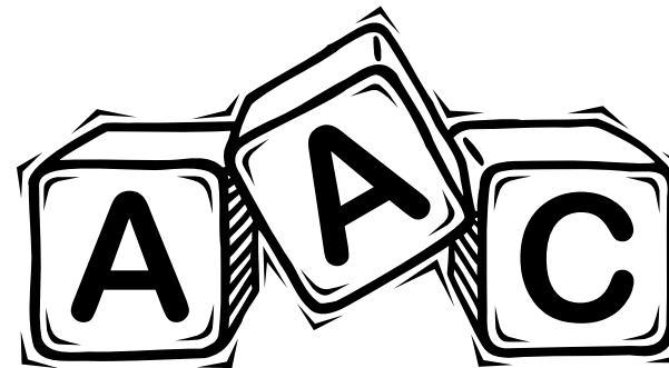
Academic Affairs Commission